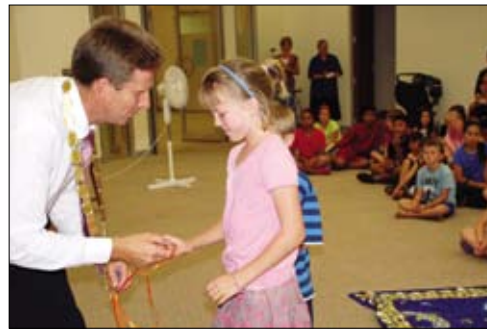
Rocket into Reading