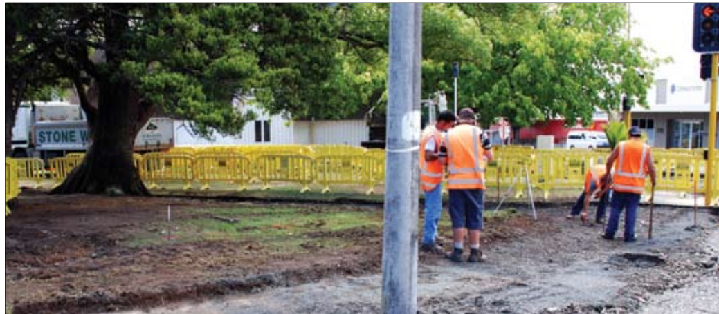
Marking out the new Northern Gateway

Outside the town centre, new subdivisions are well under way and the Council is on target to cater for the significant population