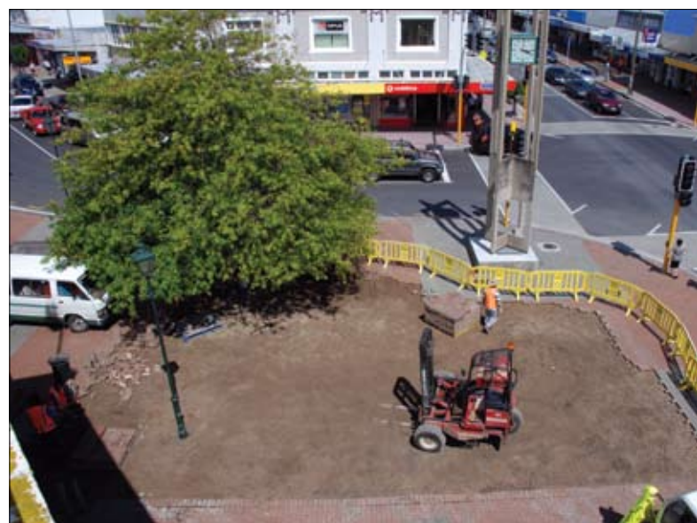
Work begins on the Streetscape enhancement of the town square