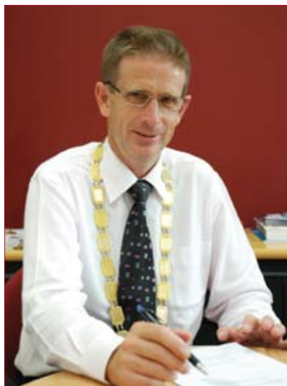
Mayor Calum Penrose