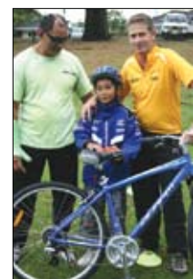
Cycle Safety Carnival, Massey Park