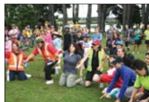
Mayoral Bike Challenge