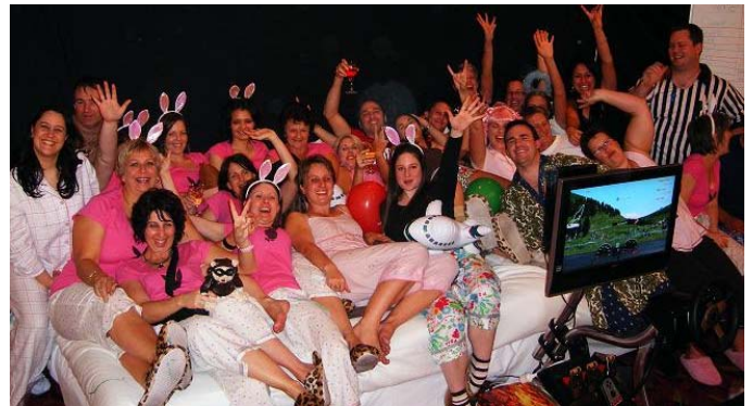
The Executive Travel team Breaking Barriers!